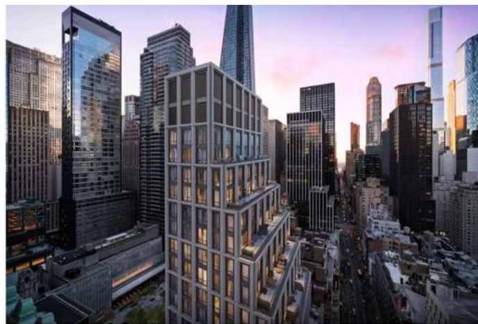
18W55 (Streetsense) | https://18w55.com/

Another perk of 18W55 is its address near numerous New York City icons. Central Park, Rockefeller Center, the MoMA, St. Patrick's Cathedral, Radio City Music Hall, Saks Fifth Avenue, and Bergdorf Goodman are located in close proximity to the building. It is also conveniently located near Midtown business districts, fine dining, Fifth Avenue designer flagship stores, and public transportation, including the E/M/6 at East 53rd Street and Grand Central Terminal.