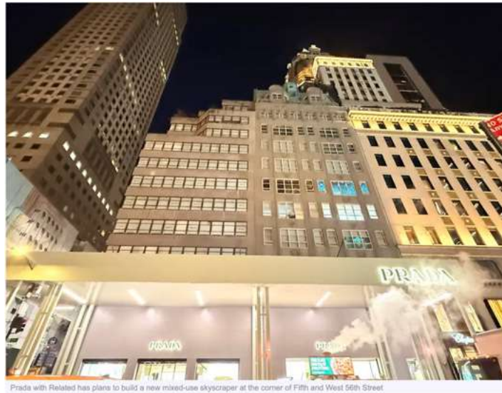
Prada with Related has plans to build a new mixed-use skyscraper at the corner of Fifth and West 56th Street

A few blocks south, exterior construction is nearly complete on the new Rolex headquarters at 665 Fifth Avenue . Pritzker Prize laureate David Chipperfield's winning proposal calls for a 25-story glass tower with five stacked cubes that reduce in size toward the top, creating a jagged profile and featuring planted terraces on each level. The project will feature a new Rolex store on the first four levels, office space for Rolex staff and tenants on upper levels, and a double-height dining and event space with adjoining terrace on the top two floors. It is aiming for LEED Platinum certification.