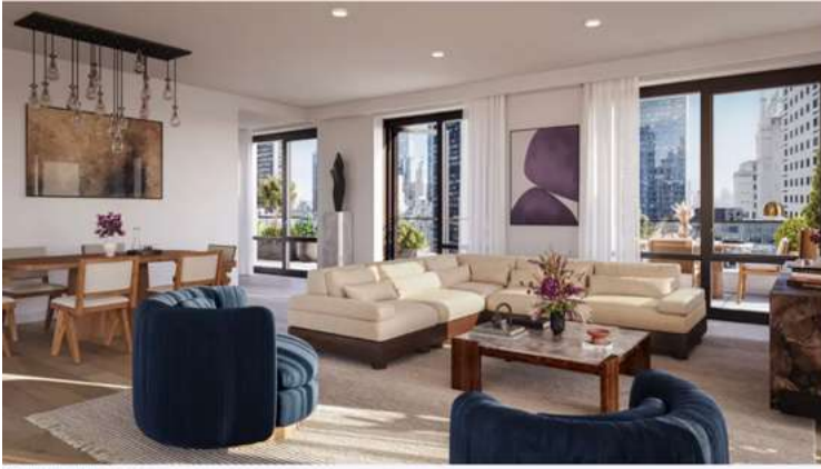
Penthouse living room