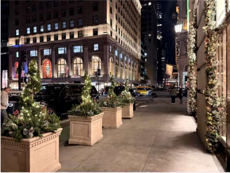
The corner of Fifth and West 55th Street in front of The Peninsula, a few doors down from 18W55