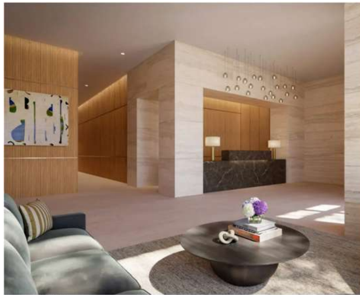
24-hour attended lobby

Residents arrive to a lobby with 24-hour doorman service and on-site concierge from LIVunLTD. In addition to fresh coffee and light breakfast items in The Parlor, the building offers a curated menu from the nearby Southern Italian restaurant Il Gattopardo . Further conveniences like The Paw Wash pet spa, a central laundry room with oversized machines, and The Vault , above-grade private storage for lease, further streamline life in the building.