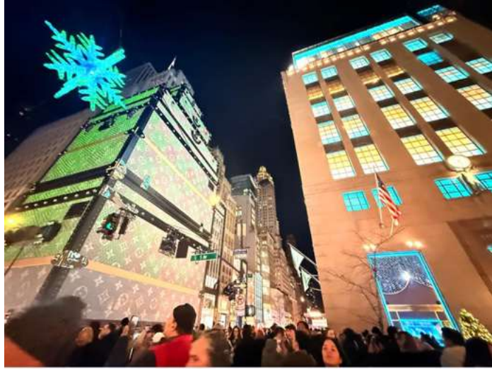
Fifth Avenue snowflake above 1 East 57th Street