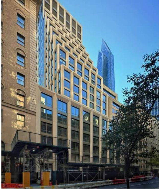
18 West 55th Street.