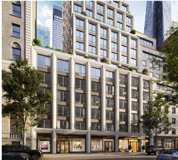
18 West 55th Street. Rendering courtesy of Streetsense.

The renderings in the main photo and below show the building's array of stepped setbacks topped with landscaped terraces. The ground floor will feature expansive floor-to-ceiling glass for the retail frontage.