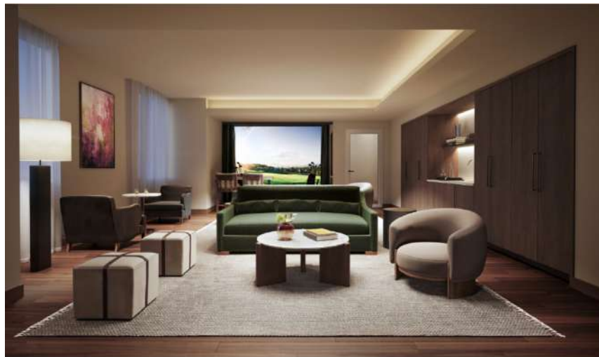
The golf lounge.

Residential amenities managed by LIVunLtd will span more than 10,000 square feet in the cellar level and floors two through eight. Offerings will include a virtual golf simulator, lounge, and cinema room.