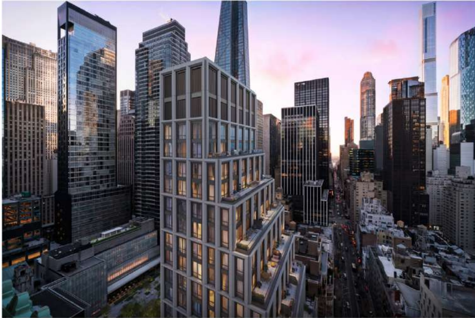
18 West 55th Street.

BY: MICHAEL YOUNG AND MATT PRUZNICK 8:00 AM ON NOVEMBER 22, 2025