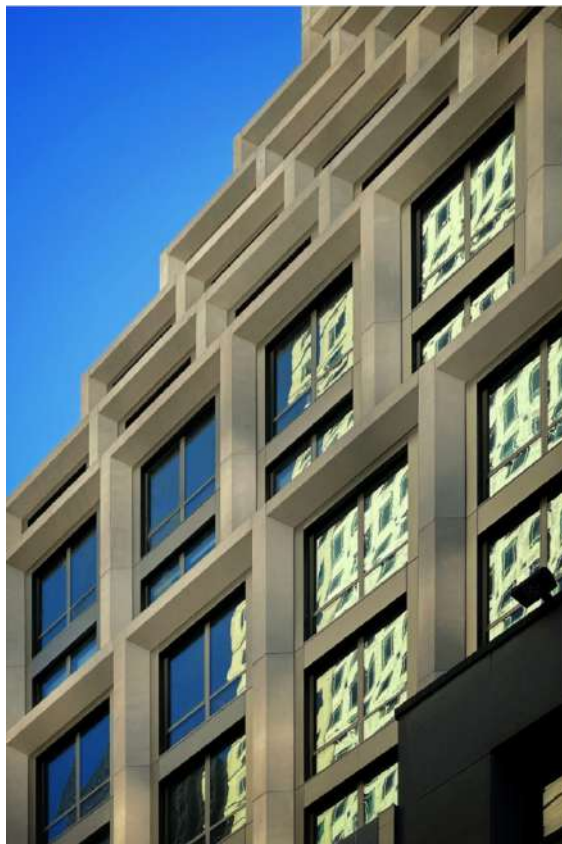
18 West 55th Street.