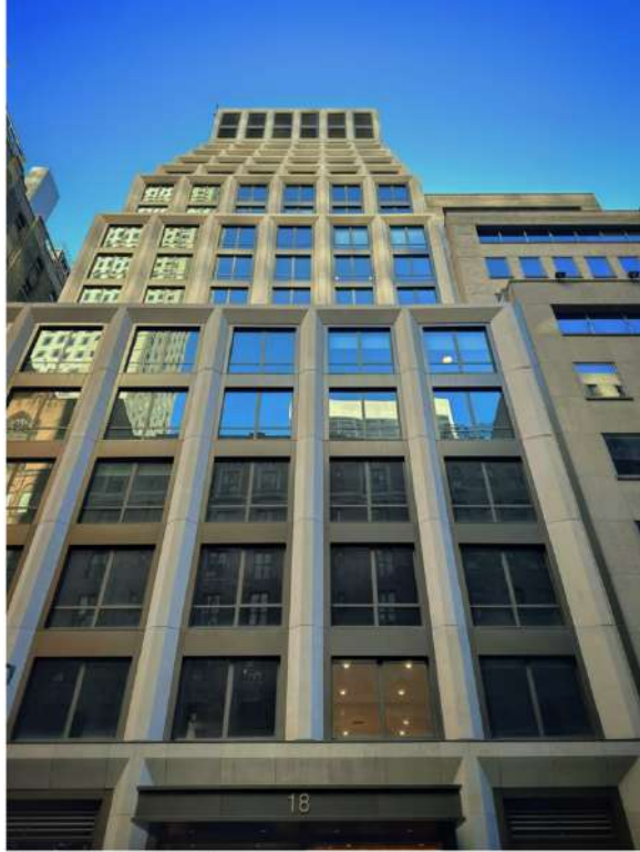
18 West 55th Street.

The canopy bearing the building's address has also been installed over the main entrance.