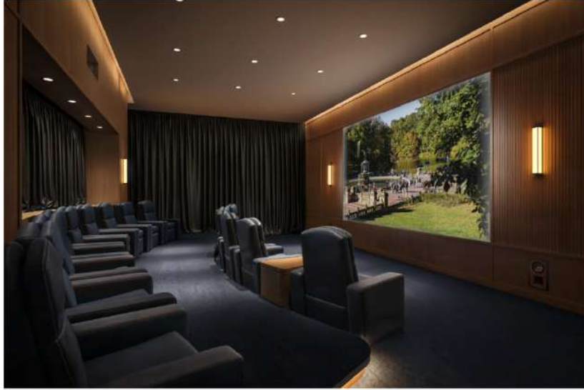
The cinema. Rendering courtesy of Streetsense.

Other amenities will include a two-story fitness center with private training studios, a resident social lounge, a two-story coworking suite with an open lounge and private conference rooms, a 24-hour attended lobby and doorman, oversized washer and dryer facilities, a dog washing station, and private storage available for lease.