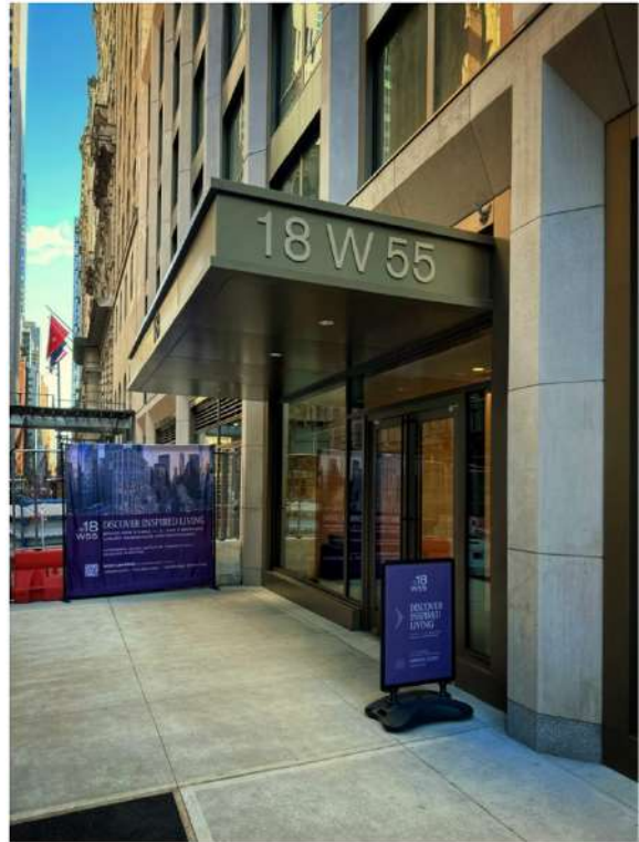
18 West 55th Street. Photo by Michael Young.

The canopy bearing the building's address has also been installed over the main entrance.