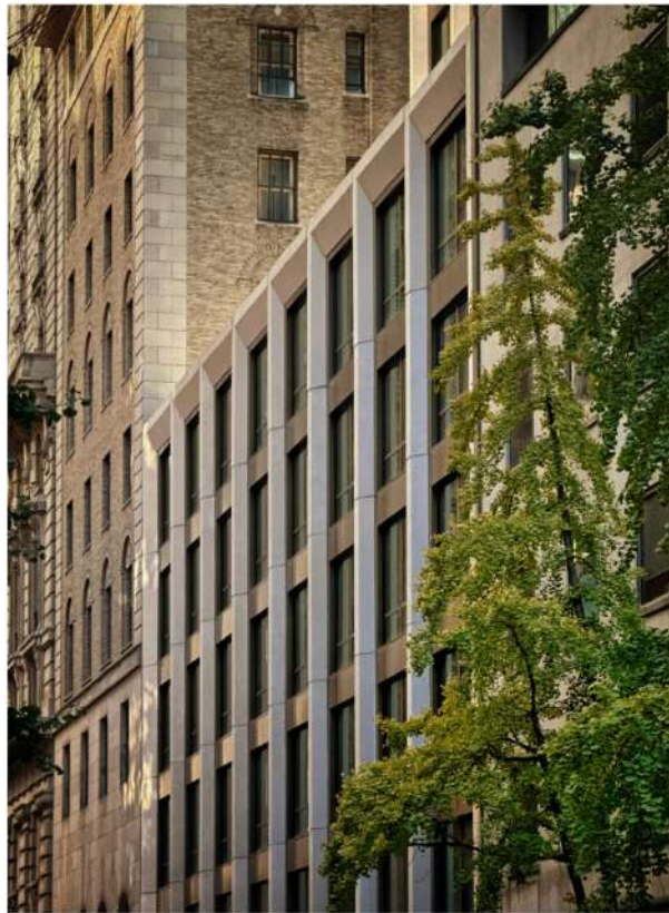
18 West 55th Street.