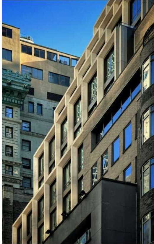
18 West 55th Street.