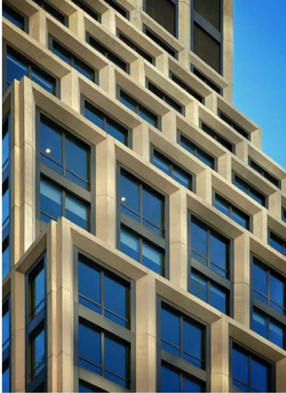
18 West 55th Street.