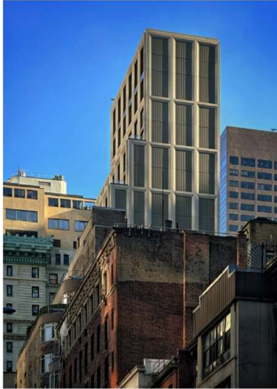
18 West 55th Street.