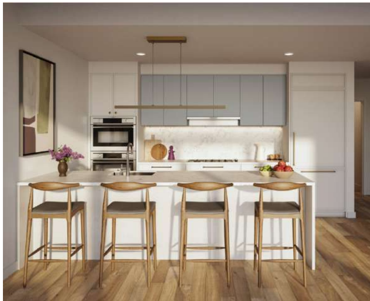
A typical open kitchen space.

The following interior renderings preview the Morris Adjmi-designed interiors for the units, which will come in studio- to three-bedroom layouts. Each will come with white oak floors, tonal lacquered cabinetry with brass pulls and panelized appliances integrated into custom pantry millwork, and solid Cambria stone countertops and backsplashes in the kitchens.