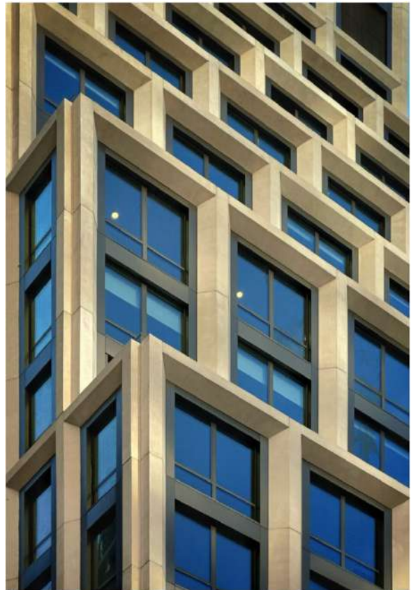
18 West 55th Street.