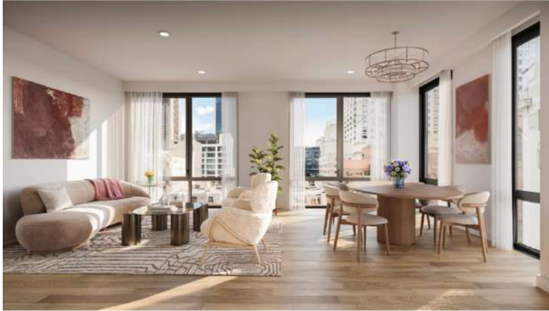
A typical living room space.

Residential amenities managed by LIVunLtd will span more than 10,000 square feet in the cellar level and floors two through eight. Offerings will include a virtual golf simulator, lounge, and cinema room.