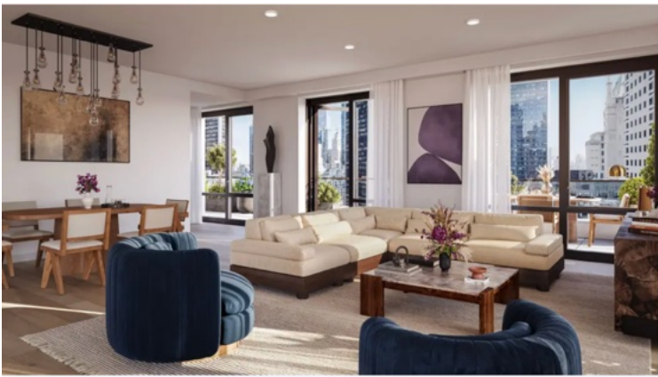
Penthouse living room