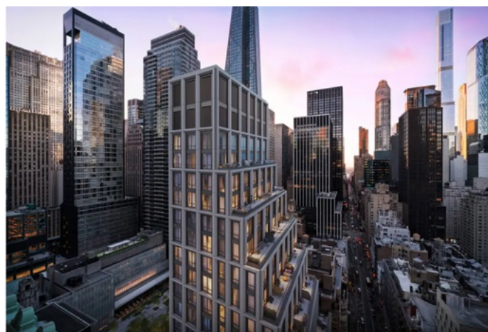
18W55 (Streetsense) | https://18w55.com/

Another perk of 18W55 is its address near numerous New York City icons. Central Park, Rockefeller Center, the MoMA, St. Patrick's Cathedral, Radio City Music Hall, Saks Fifth Avenue, and Bergdorf Goodman are located in close proximity to the building. It is also conveniently located near Midtown business districts, fine dining, Fifth Avenue designer flagship stores, and public transportation, including the E/M/6 at East 53rd Street and Grand Central Terminal.