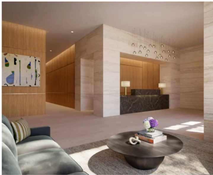
24-hour attended lobby

Residents arrive to a lobby with 24-hour doorman service and on-site concierge from LIVunLTD. In addition to fresh coffee and light breakfast items in The Parlor, the building offers a curated menu from the nearby Southern Italian restaurant Il Gattopardo . Further conveniences like The Paw Wash pet spa, a central laundry room with oversized machines, and The Vault , above-grade private storage for lease, further streamline life in the building.