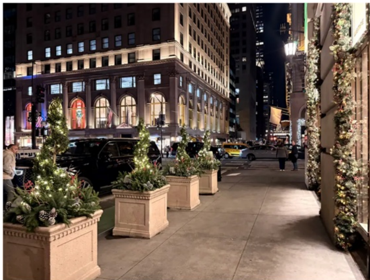
The corner of Fifth and West 55th Street in front of The Peninsula, a few doors down from 18W55