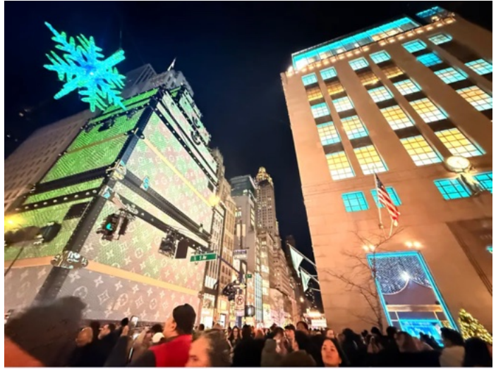
Fifth Avenue snowflake above 1 East 57th Street