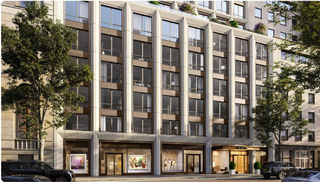
Street view of Skyline Developers' 18W55

Midtown Manhattan welcomes a luxurious rental tower that is now open to residents. It redefines high-end rental living along Fifth Avenue, ushering in a fresh chapter for luxury in Midtown. The development includes a well-appointed amenity suite designed for residents' comfort and leisure. Skyline Developers Launches Ultra-Luxury Tower in Midtown